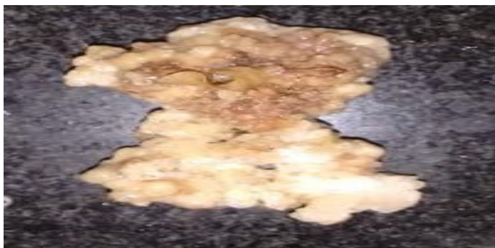
Fig. 1. Leaf induced callus on 2,4 – D mg/l Murashige and Skoog (MS) medium