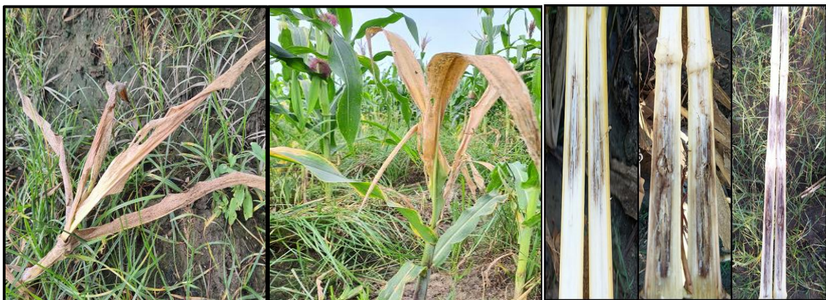
Fig. 2. Drying and killing of maize stalk by D. zea causing bacterial stalk rot